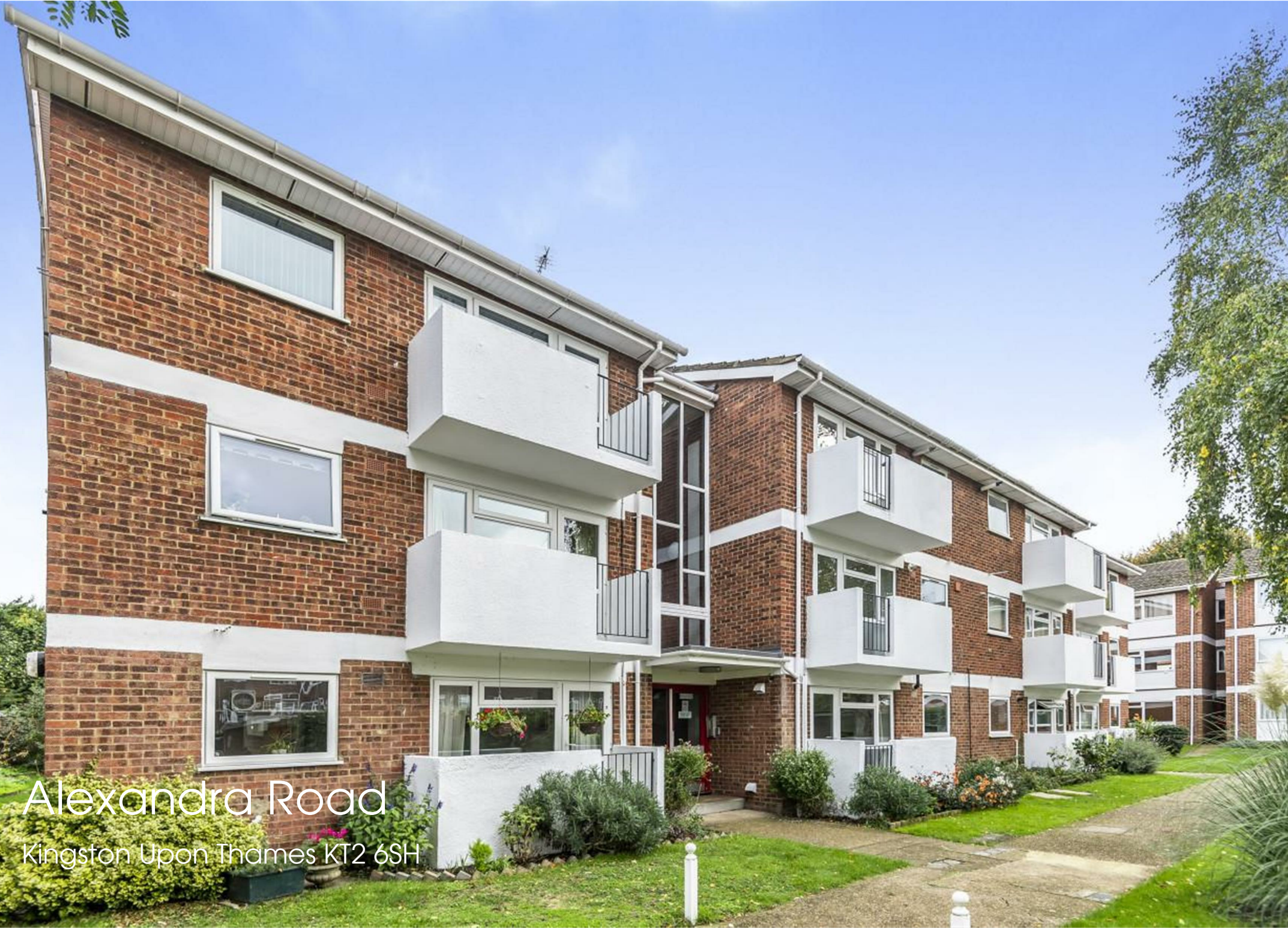
Alexandra Road Kingston Upon Thames KT2 6SH

34 Richmond Road Kingston upon Thames Surrey KT2 5ED www.gibsonlane.co.uk Tel: 020 8546 5444